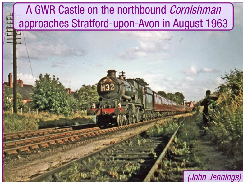
A GWR Castle on the northbound Cornishman approaches Stratford-upon-Avon in August 1963

On 25 November 2020, the DfT announced that our Bid had been successful. One of fifteen successful bids out of 50 submitted and included in the National Infrastructure Strategy. The consultants Stantec were appointed to carry out the study in February 2021.