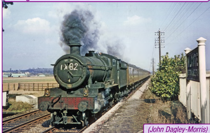
GWR Grange Class 6851 Hurst Grange heads south through Milcote with a train to Cheltenham Racecourse

A previous Stratford Rail Study by Arup in 2012 had revealed that Stratford only attracts 6% of tourist trips by rail compared to 13% for equivalent centres. Stratford-upon-Avon has 3.5m visitors to the Town, 6.0m pa to the District, and lies on a major international tourist route.